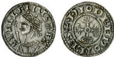
141 (x 1.5)