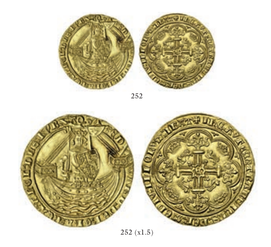
Edward III (1327-77), Noble, Treaty Period, series B, Tower, 7.69g, 4h, annulet before EDWARD, A barred in IBAT, double saltire stops both sides, king in ship, rev. i.m. cross 1, cross fleury (Schneider I, 86; N.1232; S.1503), marks on edge from a mount and obverse fields lightly tooled, otherwise a bold striking, about extremely fine

Purchased Spink, with ticket stating: 'a TRUE class Ia, an excellent example'