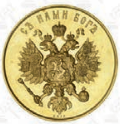
Russia, Alexander III, gold Coronation Medal, 1883 £8,000-10,000