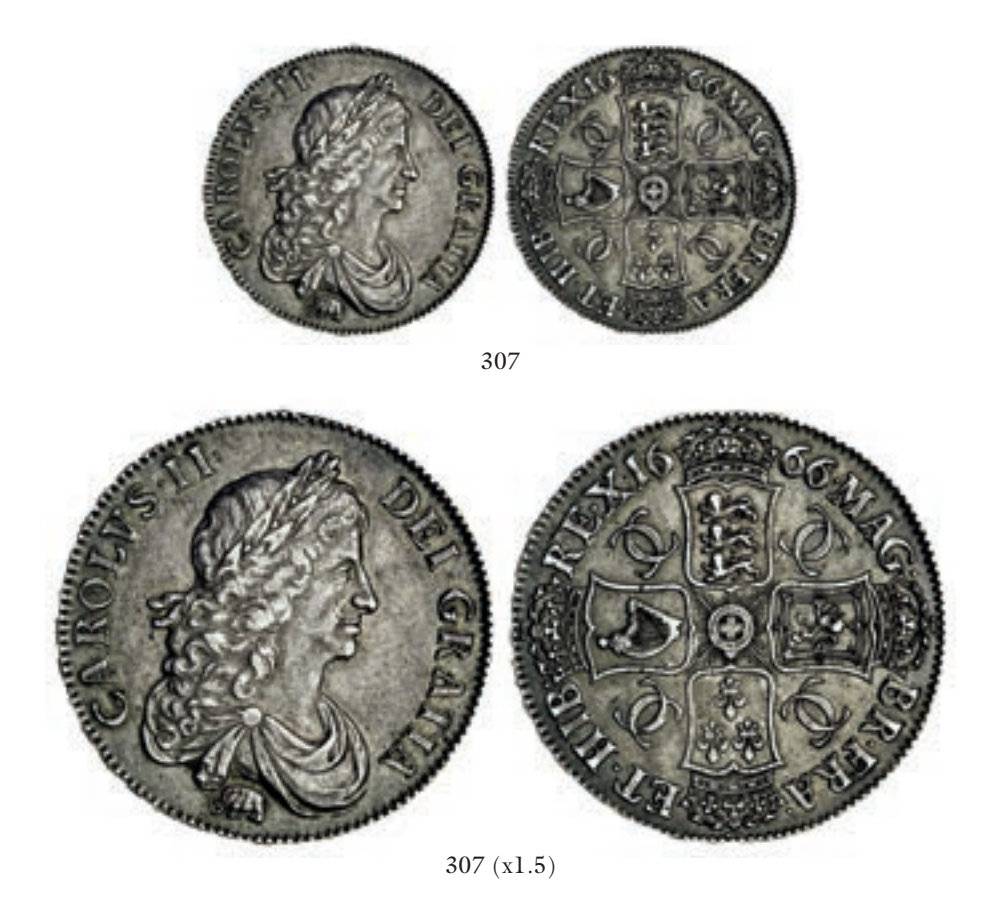
Charles II (1660-85), Crown, 1666 XVIII, second laureate and draped bust right, elephant below, rev. crowned shields cruciform, interlinked Cs in angles, RE.X variety (ESC 369 (34) ~ R2; S.3356), a nick to rim at 12 o'clock and a hint of adjustment to hair, otherwise with pleasing old cabinet tone, well-struck up for type, the Elephant especially bold, good very fine, rare; exceedingly so in this condition