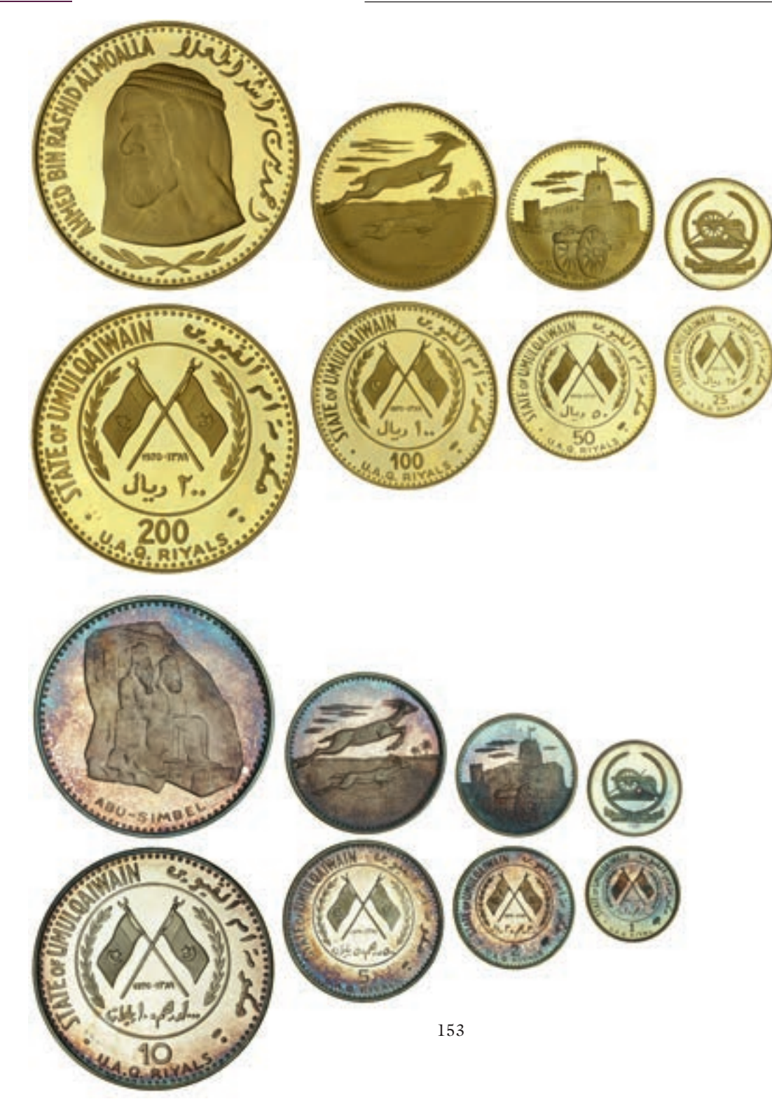
United Arab Emirates, Umm al-Qawain, Proof Set AH1389/1970, gold proof 200-Riyals, 100-Riyals, 50-Riyals, 25-Riyals, silver proof 10-Riyals, 5-Riyals, 2-Riyals, Riyal (KM PS3, containing KM 1-4, 6-9), with mirror-like fields and frosted designs, the silver coins attractively toned, all proof uncirculated, many coins with very low mintage, extremely rare as a set in this condition, in original yellow presentation box (8)

Only 5000 sets issued-mint certificate #116