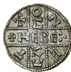
38 (x 1.5)