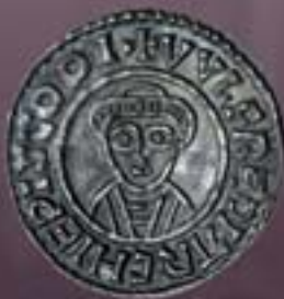
CANTERBURY, ARCHBISHOP WULFRED (805-832), PENNY

We have illustrated here a selection of coins from the first sale.