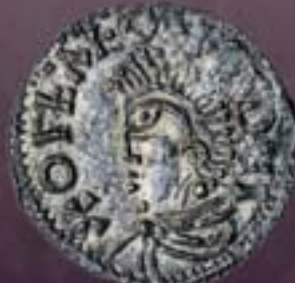
SWEDEN, OLAF SKOTKUNUNG (995-1022), PENNY, SIGTUNA