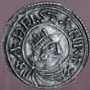
AETHELSTAN (924/5-939), PENNY, YORK