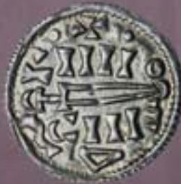
VIKINGS OF YORK, ST PETER COINAGE (c.905-915), PENNY