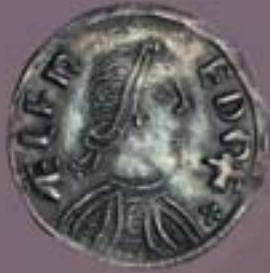
WESSEX, ALFRED (871-899), PENNY, LONDON