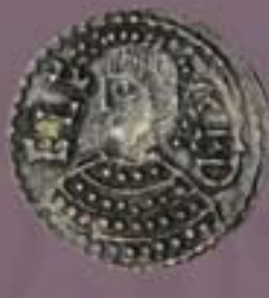
WESSEX, ALFRED (871-899), HALFPENNY, LONDON