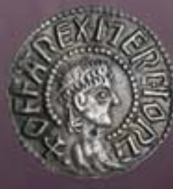
MERCIA, OFFA (757-796), PENNY