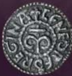
CYNETHRITH, WIFE OF OFFA, PENNY