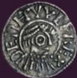
MERCIA, BERHTWULF (840-852), PENNY