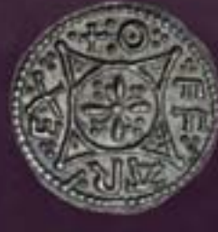
MERCIA, OFFA, WITH EADBERHT BISHOP OF LONDON (c.780-792), PENNY