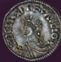
AETHELRED II (978-1016), PENNY