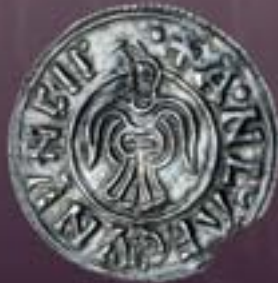
VIKINGS OF YORK, ANLAF GUTHHFRITHSSON (939-941), PENNY